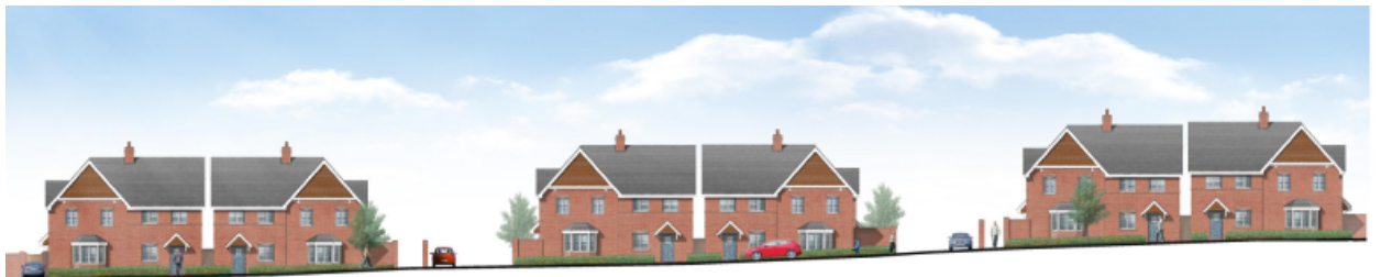
House Type H323 Plot 84 House Type M Plot 85 House Type M Plot 86 House Type H323 Plot 87 House Type H323 Plot 88 House Type M Plot 89 House Type M Plot 90 House Type H323 Plot 91 House Type M Plot 92 House Type H323 Plot 24 House Type M Plot 25 House Type M Plot 26 House Type H323 Plot 27