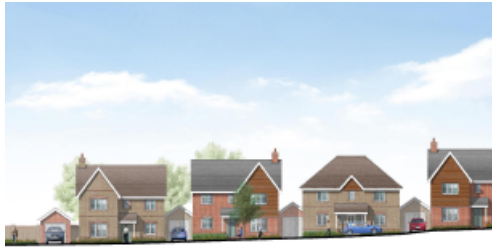
House Type H323 Plot 80 House Type H423 Plot 81 House Type H46 Plot 82 House Type H321 Plot 83