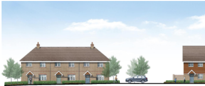
Block 3 Plot 1-10 House Type M Plot 20