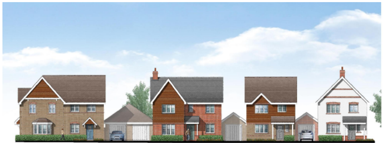
House Type H323 Plot 67